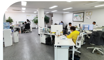
KOREA MAIN OFFICE (GOLDILOCKS SHIPPING)